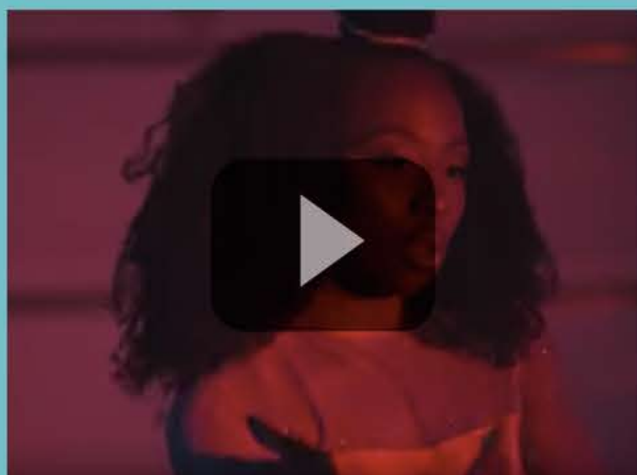
GOOD TO YOU