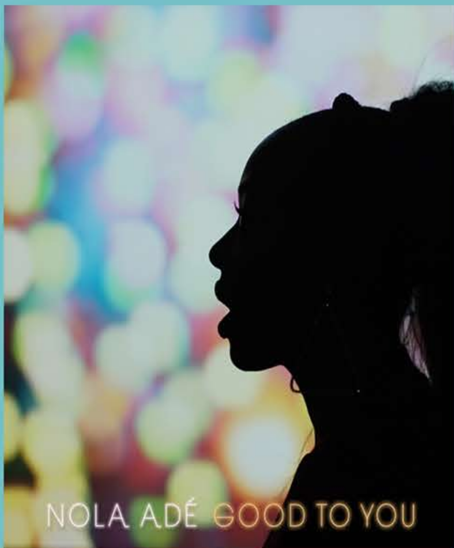
GOOD TO YOU