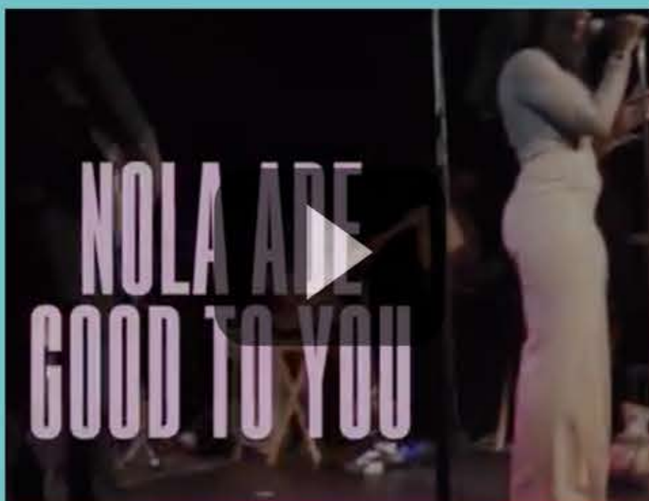
GOOD TO YOU